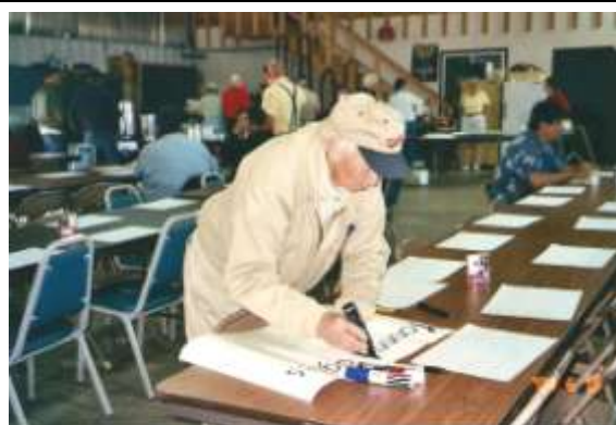
Making Signs YE-Day 2004