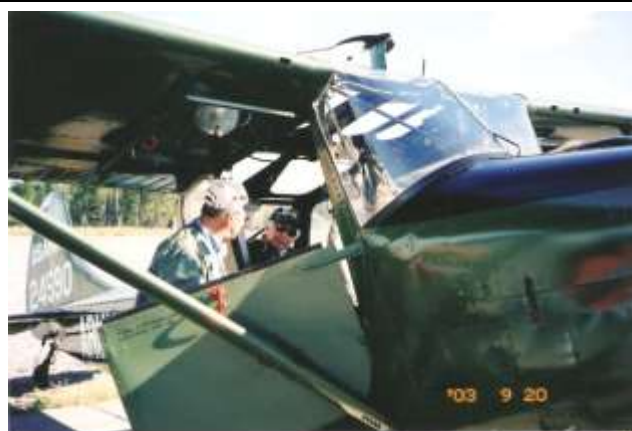
L-19 Ride Ford Airport Day 2003