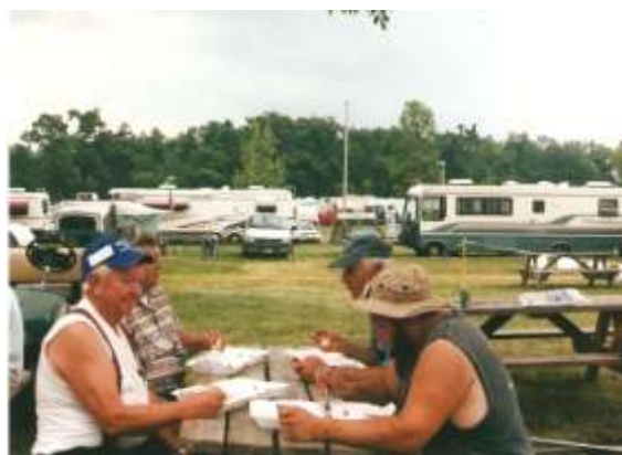
Lunch at Oshkosh