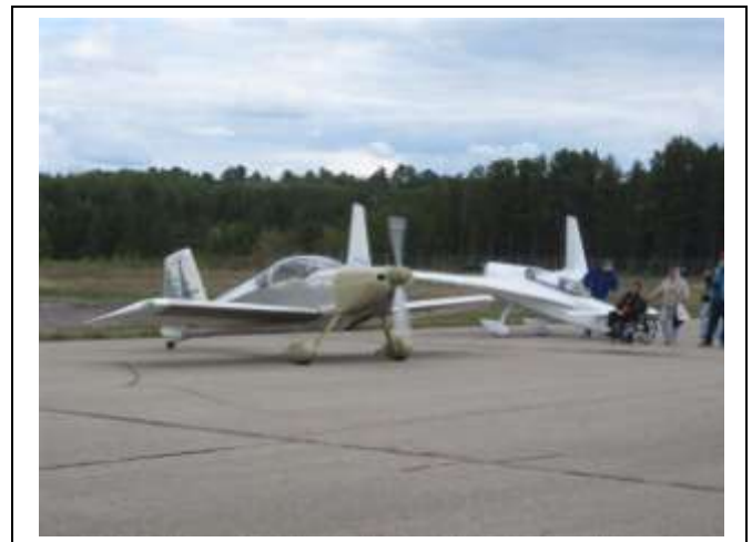
All Ford Airport Day Pictures by Mike Betti