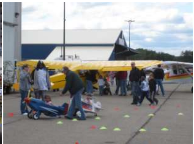
Pedal Plane Corral at Ford Airport Day