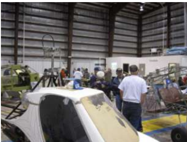
My Scorpion II Helicopter